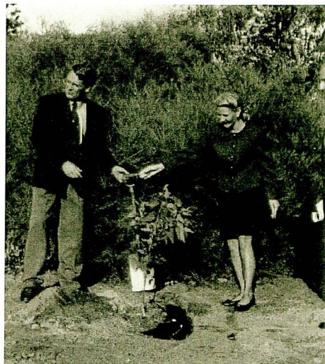
Premier Richard Court and Mrs Court share the planting of a young Tuart (Eucalyptus gomphocephala) in the garden north-east of the Pioneer Womens' Memorial Fountain, to commemorate launching the Friends group.

Mr. Court declared his family's affection for Kings Park, as a place to frequent, especially during Spring. During his speech he stated "Although my Government is pro-development I favour the protection of significant wildflower areas and expect a renewed push toward the protection of endangered species ... Reserves such as Kings Park need to be preserved at all cost, as do other large parks in the metropolitan area." Mr. Court and his wife Jo planted a tree to mark this auspicious occasion in the history of the Park (see photo).